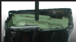
USGI Green "Anti Tilt"

True 4 way Anti Tilt -Compare the difference