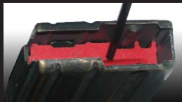
Magpul "Enhanced" SLF